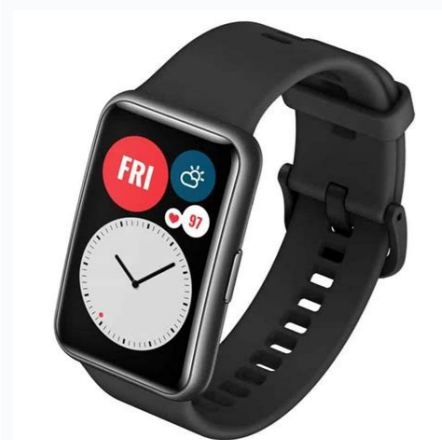
How to connect lg g watch to phone. Best watch for lg phone.